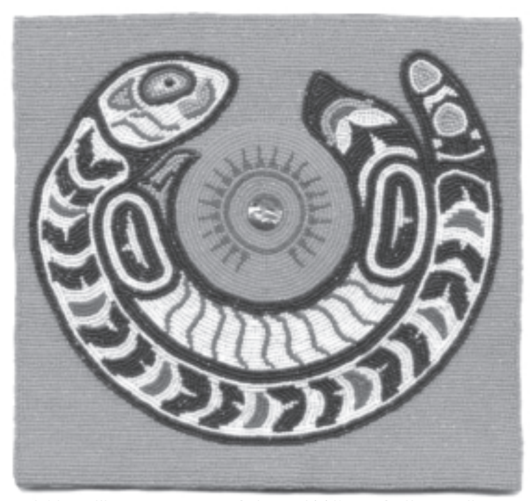
Elakha Alliance Logo, Confederated Tribes of Siletz Indians

Native American art can be anything a Native person makes that is an authentic expression of their vision. Often it may not be identified as art, but as craft, or simply a tradition, ceremony, historical artifact, or even spiritual