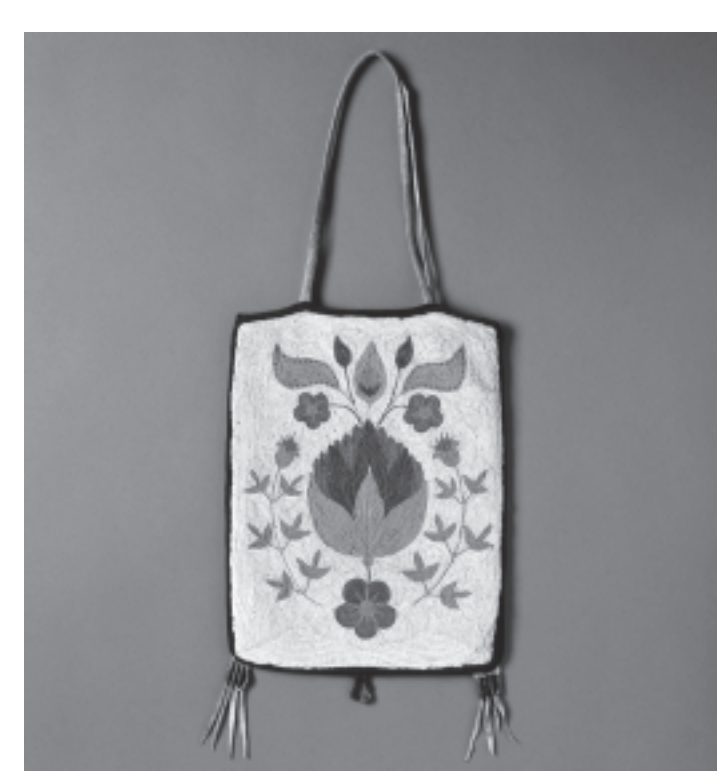
Beaded Bag, Middle Columbia River art, ca 1940

OPPORTUNITY: Support Nativerun organizations working to address the "digital divide"—lack of access to the Internet and technology—and encourage them to offer technical assistance and support website development for Native artists.