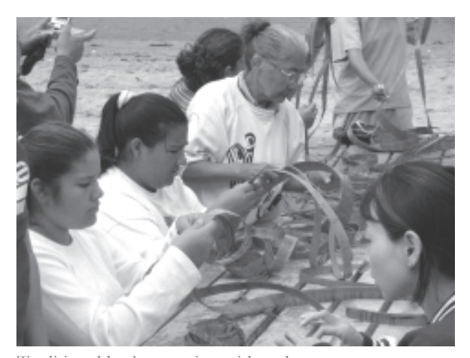
Traditional basketweaving with cedar

OPPORTUNITY: Encourage Native arts organizations to advocate for Native artists so they are more visible and facilitate tribal leader understanding about the urgency of