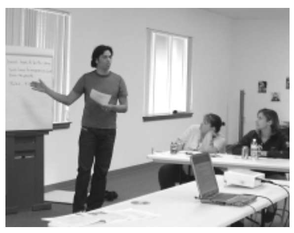
Potlatch Fund grantwriting training program.

PROBLEM: Even when grants or donors are available, many arts organizations and most individual artists do not have expertise in preparing donor letters or foundation proposals.