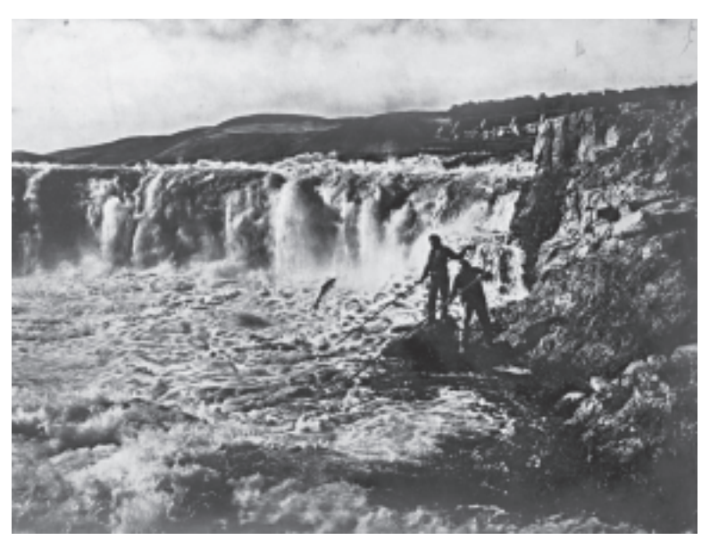
"Fishing at Celilo Falls, 1901," historic fishing and trading site dried up due to the construction of the Grand Coulee Dam

standards of giving, redistribution, and shared abundance, was the original economy of these lands. Northwest coastal tribes use the word potlatch