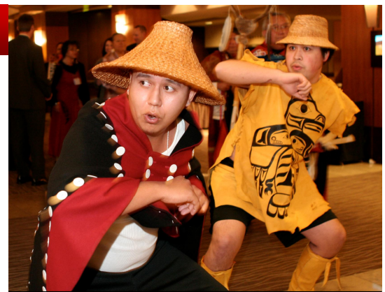
Haida Heritage Dancers

Please continue to monitor the online calendar for new updates and schedule changes.