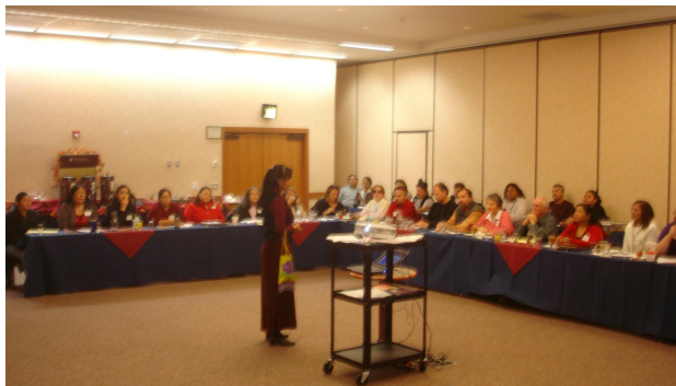
The amazing group from Warm Springs.

Arising from the training, Potlatch Fund has already paid out two mini-grants - one to support the local radio station and one to support the local newspaper (these mini-grants have been supported by the Meyer Memorial Trust). It was a privilege to provide this training to the Warm Springs community and we are now looking forward to a funders tour to Warm Springs scheduled for April.