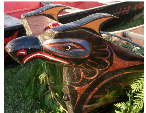
A long deserved rest following the 2007 InterTribal Canoe Journey.

21/22 – The Journey to Successful Fundraising Fort Peck, MT