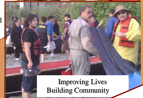
Improving Lives Building Community