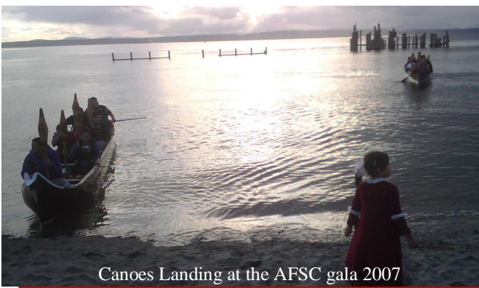
Canoes Landing at the AFSC gala 2007

Amnesty International recently published "Maze of Injustice" a study that examines the failure to protect Indigenous women from sexual violence in the USA. Copies of this disturbing report can be found at: www.amnesty.org