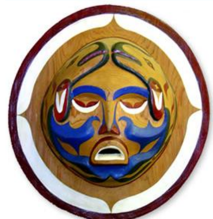
Micah McCarty "Spirits of the Grey Whale"

Please continue to monitor the online calendar for new updates and schedule changes.