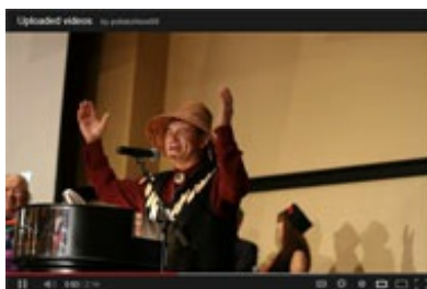
View the 2012 Leadership Honoring Video

To access the 2013 Nomination Form click here .