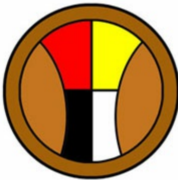
Potlatch Fund Logo

To view the 2012 Silent Auction click here .