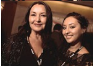
Attendees enjoy the reception.

As a way of honoring the spirit of the potlatch, the annual Potlatch Gala brings together leaders from Tribal and grassroots organizations, foundations, corporations, and individual community members. In 2010, for the first time in its history, the Potlatch Gala broke the $100,000 donation mark. This year, over 400 people joined the annual event, including representation from over twenty-five different Northwest Tribes, and collectively, over $170,000 was raised. This was Potlatch Fund's most successful event to date by far, and sold out six weeks before the night of the event.