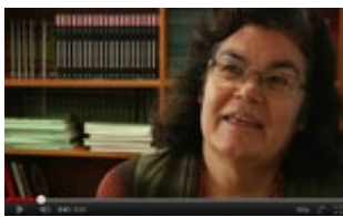
Leadership Honoring Video