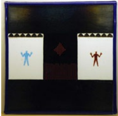
Items from the Third Silent Auction