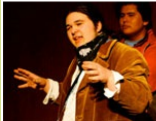
Red Eagle Soaring

are just two of the many organizations funded in 2011.