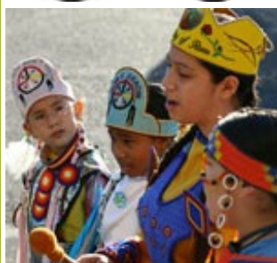
Painted Sky and