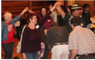
Participants at the Volunteer Appreciation Event enjoy a dance of "Hunters and Ducks".