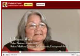
Leadership Honoring Awards