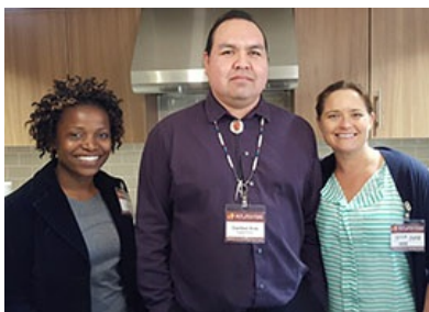
Past Native Professionals and Friends Night in Spokane.

Potlatch Fund recognizes the importance of bringing people together to share our stories and experiences. Our intent is to generate deeper connections and conversations among Native professionals and our extended community.