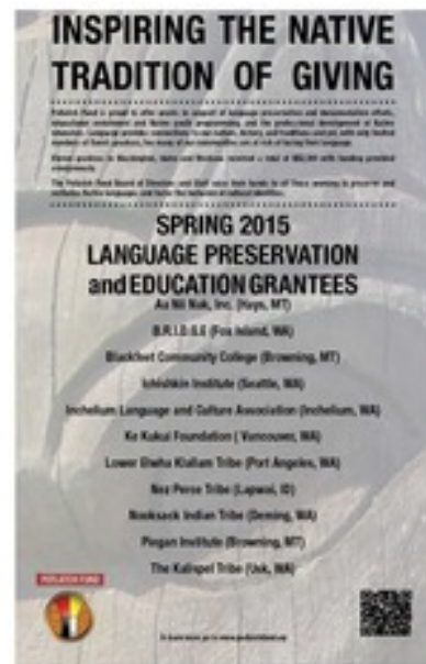
Language Preservation and Education

Under the 2015 Spring Grant Cycles 42 grants, totaling $152,420, were awarded in the areas of