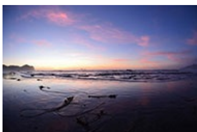
Winter Sunset at