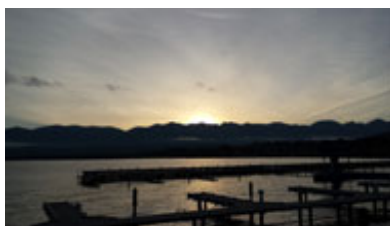
Sunrise on Flathead Lake during the 2014 Fall Cohorts Convening in Polson, MT at the Kwa TaqNuk.