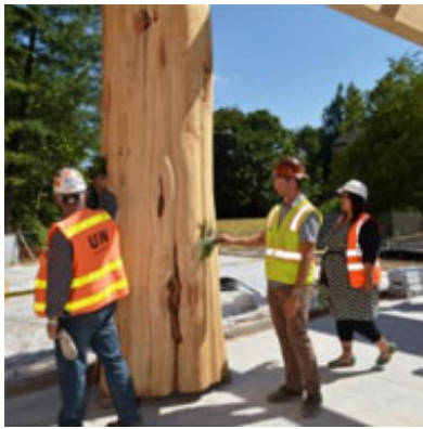
Log Blessing - August 6, 2014.