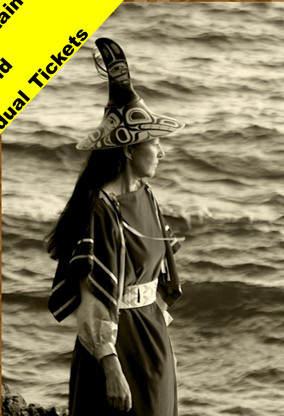
Table Captain and Individual Tickets